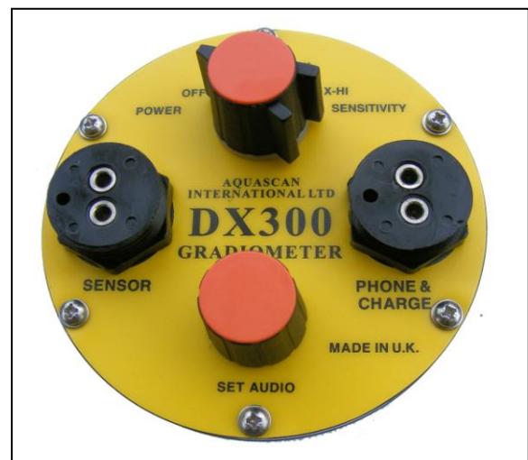
DX-300 module controls & Connections